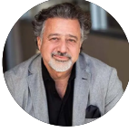
Raad Ghantous Raad Ghantous & Associates